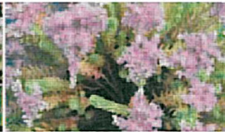
Sedum Pulchellum Widow's-cross 10cm, brilliant pink, rich flowering, lush green foliage