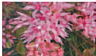
Sedum Spurium Coccineum 15cm, dark pink flowers