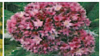
Sedum Telephium Fabaria 40cm, dense purple read umbels, dark stemmed, strong blue-green foliage. Attracts bees.