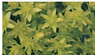
Sedum Hybridum Czars Gold 15cm, golden, rich flowering, reddish stems, ever green carpet