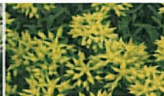
Sedum Floriferum Bailey's Gold 10cm, golden, evergreen, crenate foliage