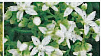
Sedum Album White 10cm, white umbel panicles