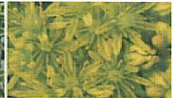
Sedum Montanum Jenny 20cm, golden, dark green needle-like foliage