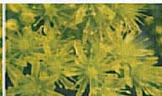
Sedum Reflexum Crooked Yellow Stonecrop 30cm, yellow flowers with grey leaves