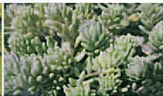
Sedum Hispanicum Spanish Stonecrop 10cm, cushion plant, whitish-pink, grey-green cushions