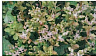
Sedum Stoloniferum Stolon Stonecrop 20cm, pink, starshaped flowers, red stems

There are sixteen varieties of sedum in our vegetation mat – resulting in extended interest and colour throughout the growing season. Colours range from greens through to vibrant reds, oranges and purples and browns. As well as offering a huge variety of colour, the different plants offer many different leaf types and flowers, resulting in a blend of beautiful textures when planted together.