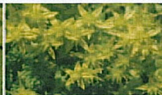
Sedum Acre Yellow 6cm, yellow, mat-forming