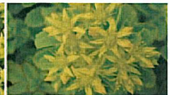
Sedum Ellacombianum Selskianum hort. 10cm, yellow, unbranched stems and scalloped leaves