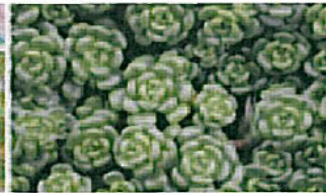
Sedum Oreganum Oregon stonecrop 5cm, yellow, forms cushions, red-brown in sunlight