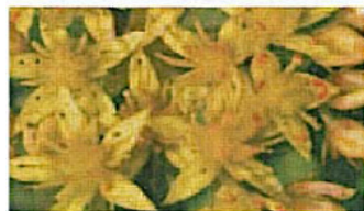
Sedum Aizoon Euphorbioides 40cm, abundant yellow star shaped flowers